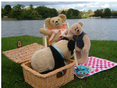
Picnic by Mill Pond