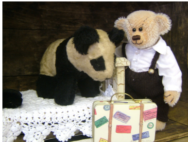
A warm welcome